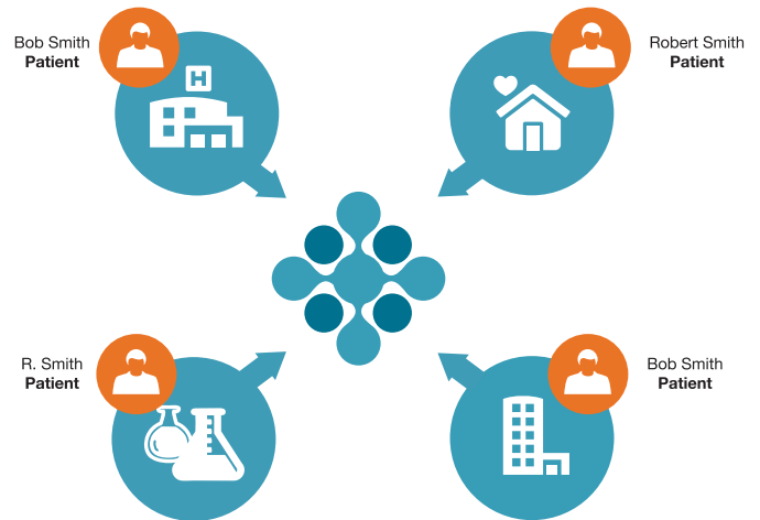
Person Enrollment uniquely identifies each individual in the CommonWell network.

CommonWell supports consumer-driven preferences for data sharing. Users of connected systems (for example, front-desk staff at a clinic) enroll an individual into CommonWell with that person's cooperation, ideally using a strong identifier (like a driver's license) to ensure that their records are accurately linked. This action can be accomplished through their local HIT system's interface or through an optional CommonWell-provided Web interface.