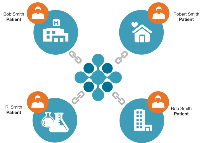
Patient Identification & Linking connects each individual's clinical records across care settings.

These states are referred to as Levels of Link Assurance , or LOLA , by CommonWell.