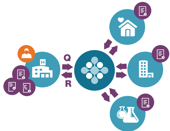
Data Query & Retrieval enables caregivers to receive the patient data they need, when and where they need it.

While CommonWell itself never stores clinical data, the platform uses a layered security approach to help ensure the safety of the clinical and demographic data being transferred. Client certificates, Java Web Tokens, and SAML are used to authenticate a given Edge System to the CommonWell services. Only trusted systems are permitted to execute requests against the platform.